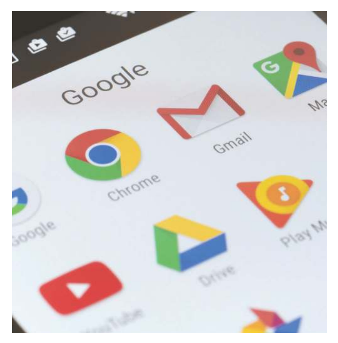
in Turkey. As a result of these remedy submissions, the TCA through its Compliance Decision, assessed whether Google had fulfilled the obligations implemented within the Infringement Decision.

Compliance decision or Googless three separate remedy submissions. Further to the Non-Compliance Decision, Google made three separate submissions. The first submission, dated 16 July 2019, consisted of informing the TCA of the notification made by Google to all Mobile Application Distribution Agreement (MADA) partners that Google would no longer approve new devices to be distributed in Turkey under the current MADA and Android One agreements pursuant to the Infringement Decision. The second and third submissions, made on 25 December 2019 and 06 January 2020, contained template (i) Turkey Mobile Application Distribution Agreement (TMADA), (ii) Turkey Revenue Share Agreement (TRSA), and (iii) Turkey Google Widget Placement Agreement, which will be signed with device partners for devices to be distributed